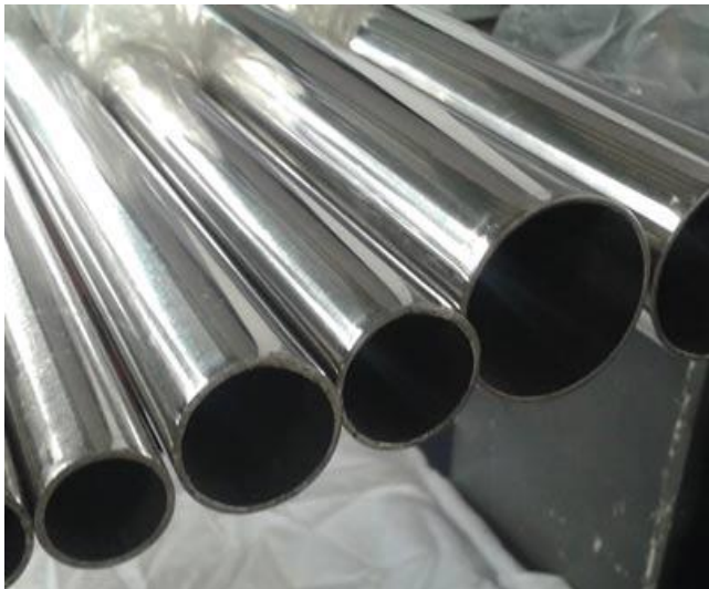
Jindal SS Seamless Pipe